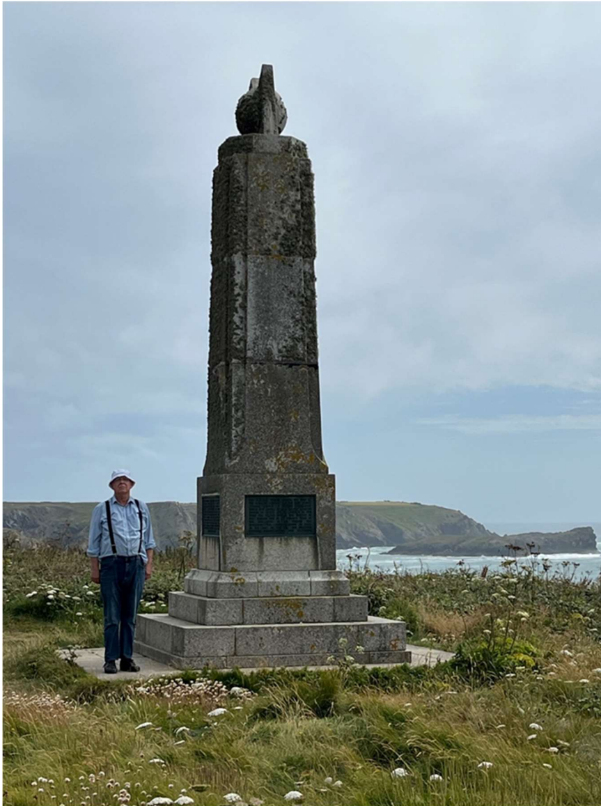
MARCONI MEMORIAL AT POLDHU SITE