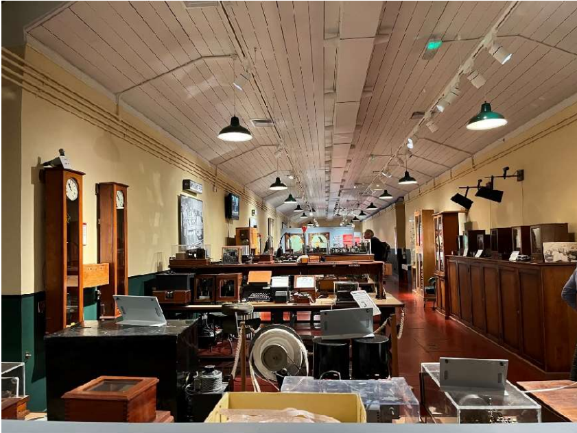
EQUIPMENT DISPLAY IN UNDERGROUND BUNKER