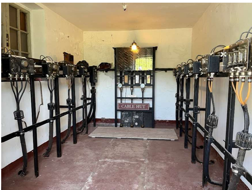
CABLE TERMINATION HUT