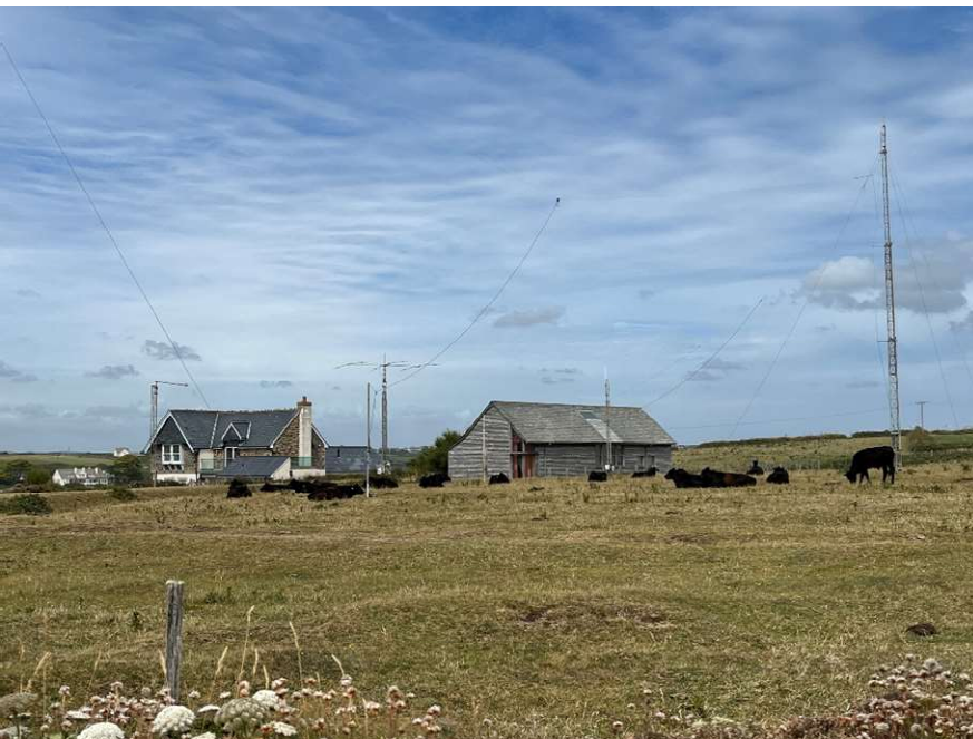
POLDU RADIO CLUB MEETING PLACE (on right)