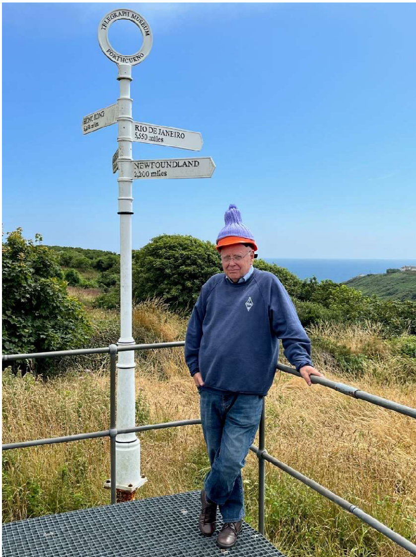
G3WRR RESPECTING LOCAL HEALTH & SAFETY RULES