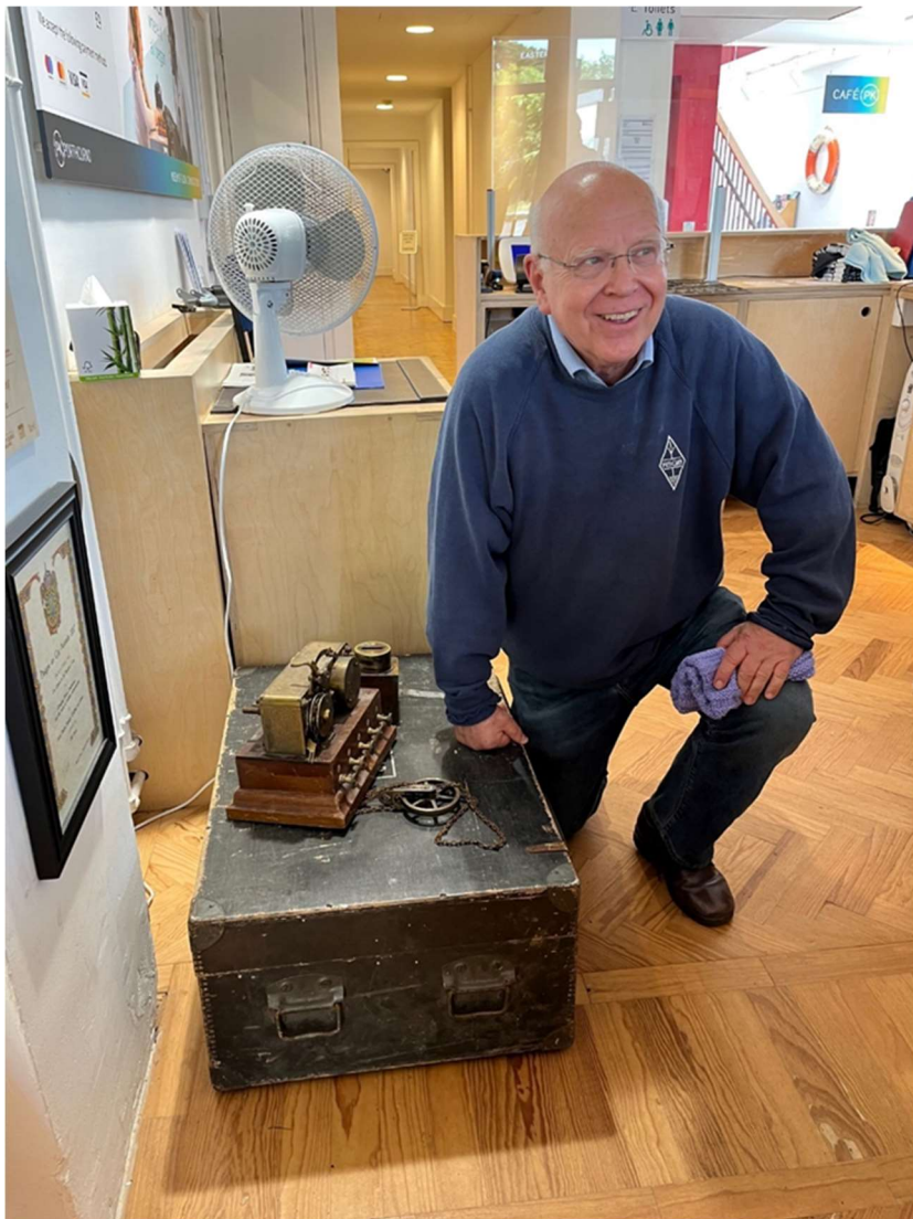
HANDOVER OF TELEGRAPH GEAR TO THE MUSEUM